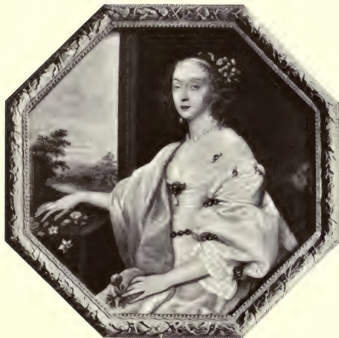
MARY, DUCHESS OF RICHMOND AND LENOX (1623-1685) BY JEAN PETITOT THE ELDER (1643)